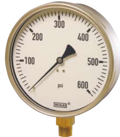
Bourdon Tube Pressure Gauge Model 212.20

Additional error when temperature changes from reference temperature of 68°F (20°C) ±0.4% for every 18°F (10°C) rising or falling. Percentage of span.