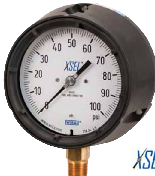
Bourdon Tube Pressure Gauge Model 212.34

Additional error when temperature changes from reference temperature of 68°F (20°C) ±0.4% for every 18°F (10°C) rising or falling. Percentage of span.