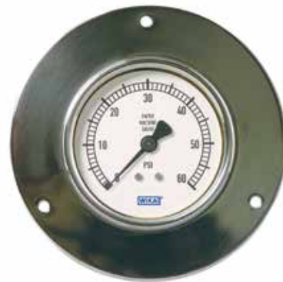
Bourdon Tube Pressure Gauge Model 212.40PM