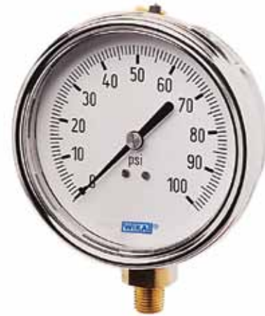
Bourdon Tube Pressure Gauge Model 21X.54