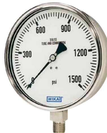
Bourdon Tube Pressure Gauge Model 232.50

Ambient: -40°F to +140°F (-40°C to +60°C) - dry -4°F to +140°F (-20°C to +60°C) - glycerine-filled -40°F to +140°F (-40°C to +60°C) - silicone-filled