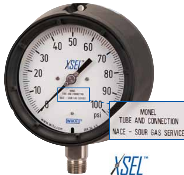
Bourdon Tube Pressure Gauge Model 232.34 NACE

Additional error when temperature changes from reference temperature of 68°F (20°C) ±0.4% for every 18°F (10°C) rising or falling. Percentage of span.