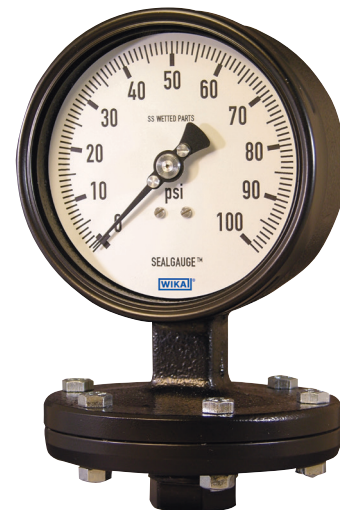
Diaphragm Pressure Gauge Model 422.12

Additional error when temperature changes from reference temperature of 68°F (20°C) ±0.8% of span for every 18°F (10°C) rising or falling.