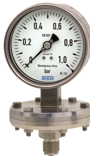
Diaphragm Pressure Gauge Model 432.36