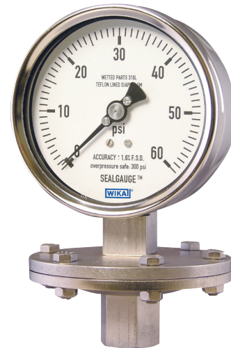
Diaphragm Pressure Gauge Model 432.50

Ambient: -4°F to +140°F Medium: +212°F maximum Storage: -40...+158°F (ranges ≤ 25" WC: -4...+158°F)