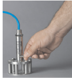
Holding the magnet perpendicular near the bottom decreases the output

Note: Span calibration must be done at the factory.