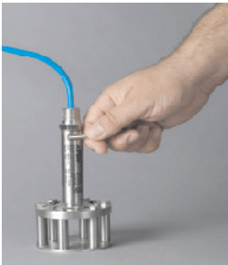
Holding the magnet perpendicular near the top increases the output.

If the zero output values do not change right away, hold the magnet in place near the top of the can until the values change, up to two minutes. If there is no change, repeat the procedure near the bottom of the can. If there is still no change, consult the factory.