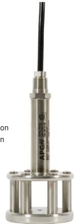
*Shown with anti-snag cage.

Note: ▲ Indicates this option is standard.