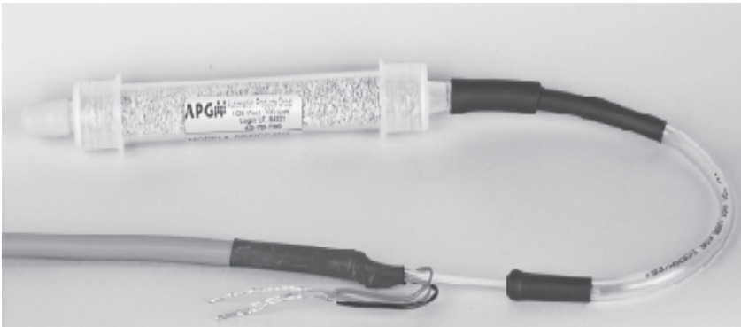
Desiccant Drying Cartridge with vent tube adapter attached to vented cable

Note: Replacement of the desiccant cartridge is recommended when the desiccant crystals have turned from blue to pink.