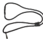
Neck strap GA-NS-1