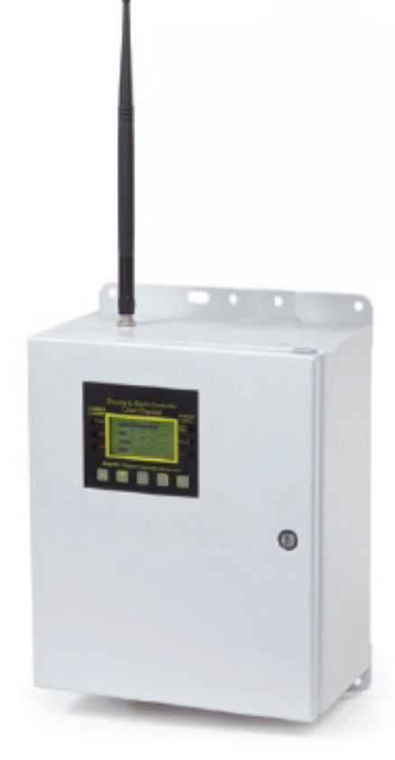
Available in NEMA 4X non-metallic, painted or stainless steel and NEMA 7 explosion proof wall mount

Unlike mesh networks and other systems designed for short range applications, the C2/TX utilizes Frequency-Hopping Spread Spectrum (FHSS) modems that offer higher power, longer range and lower susceptibility to interference. An optional multi-interface board supports an RS-232 or RS-485 wired serial port for remote MODBUS access, a solid-state data logger with USB interface, a second 900 MHz or 2.4 GHz radio for dedicated wireless remote access as well as an 802.11 WiFi interface for access via smartphones or tablets. WiFi-enabled C2/ TX controllers also feature an integrated web server that allows users to remotely view real-time data, historical information and current configuration. With the correct password, remote users can change system setup variables. Finally, an optional satellite / cellular modem enables remote access from anywhere in North America.