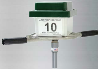
EcoProbe (wireless temperature Probe)