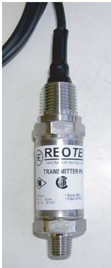
(Factory Mutual and Canadian Standards Association Approved)