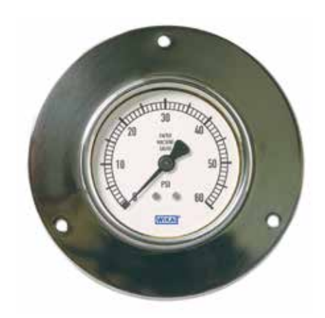
Bourdon Tube Pressure Gauge Model 212.40PM