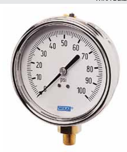
Bourdon Tube Pressure Gauge Model 21X.54