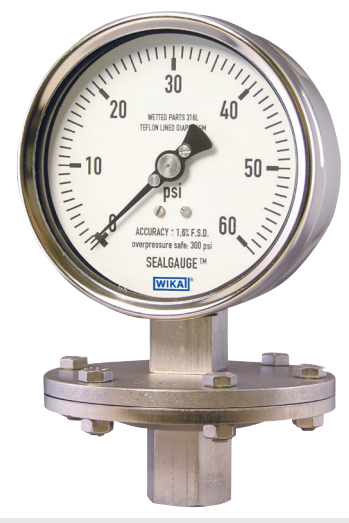
Diaphragm Pressure Gauge Model 432.50

Storage: -40...+158°F (ranges ≤ 25" WC: -4...+158°F)